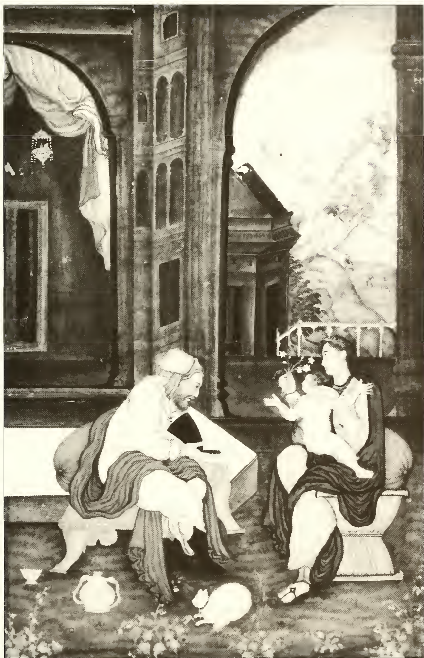
Figure 13. Holy Family , attributed to Mani (act. 1590–1600). India, Mughal period, Akbar period, ca. 1595. Album page; opaque watercolor on paper, image: 16 x 10, folio: 45.5 x 28. Free Library of Philadelphia, Rare Book Department, John Frederick Lewis Collection of Oriental Manuscript Leaves M.70